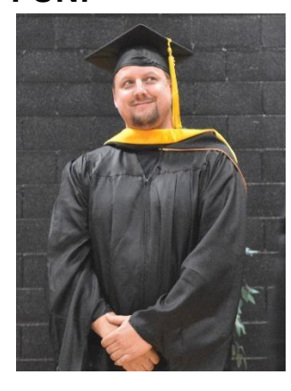
Page 8 of 37